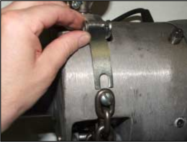
Figure 4. Positioning Upper Hanger Bracket

Read and comply with American National Standard Safety Standard ANSI B30.16 - Latest issues and Hoist Manufacturers Institute "Do's and Do Not's for Electric and Air Powered Hoists."