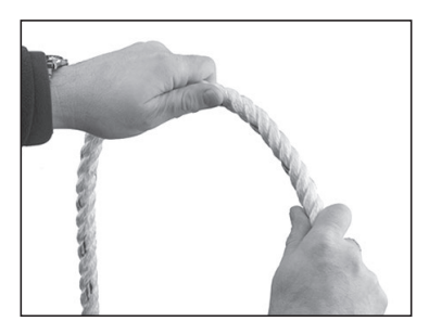
Figure 4: Inspecting the rope.

Rope Lifelines: Rotate the rope lifeline while inspecting the entire length for any fuzzy, worn, broken, or cut fibers. Weakened areas from extreme loads will show a visible change in original diameter. The rope diameter should be uniform throughout the entire length following a short break-in period. See Figure 4.