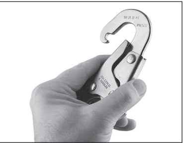
Figure 5: Inspecting the snap hooks and carabiners.

Thimbles: The thimble must be firmly seated in the eye of the splice. The splice should have no loose or cut strands. The edges of the thimble must be free of sharp edges, distortion, or cracks. See Figure 6.