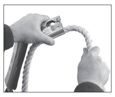
Figure 6: Inspecting the thimble.

Thimbles: The thimble must be firmly seated in the eye of the splice. The splice should have no loose or cut strands. The edges of the thimble must be free of sharp edges, distortion, or cracks. See Figure 6.