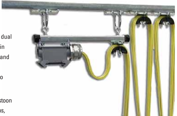
Control Box Trolley Receptacle for Pendant Connection

Magnetek can provide "Plug and Play" hardware for almost every festoon system. Plug and Play hardware, along with our pre-assembly options, can significantly reduce installation costs. Please consult the factory with your application requirements.