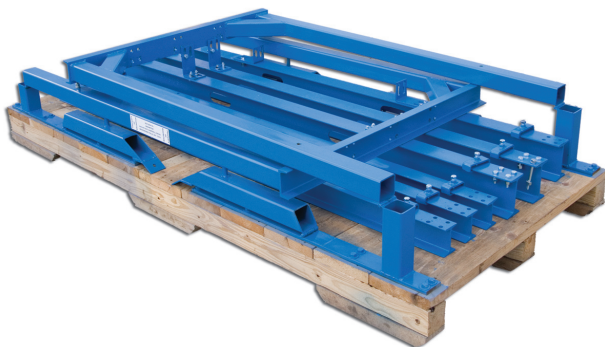
Disassembled festoon shipping stand

Now you can eliminate the expense of custom fabricated festoon shipping stands when ordering assembled festoon systems. We now offer our customers a returnable festoon shipping stand that significantly reduces system costs. Our festoon shipping stands have been designed in a standard size that's adjustable to accommodate up to three 10-foot I-Beams so customers can hang systems with longer storage lengths and more trolleys. Plus, our stands have been designed to be collapsible to minimize the return freight cost for our customers.