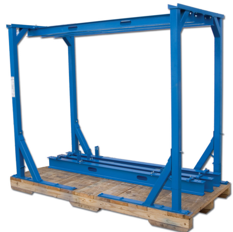
Assembled festoon shipping stand