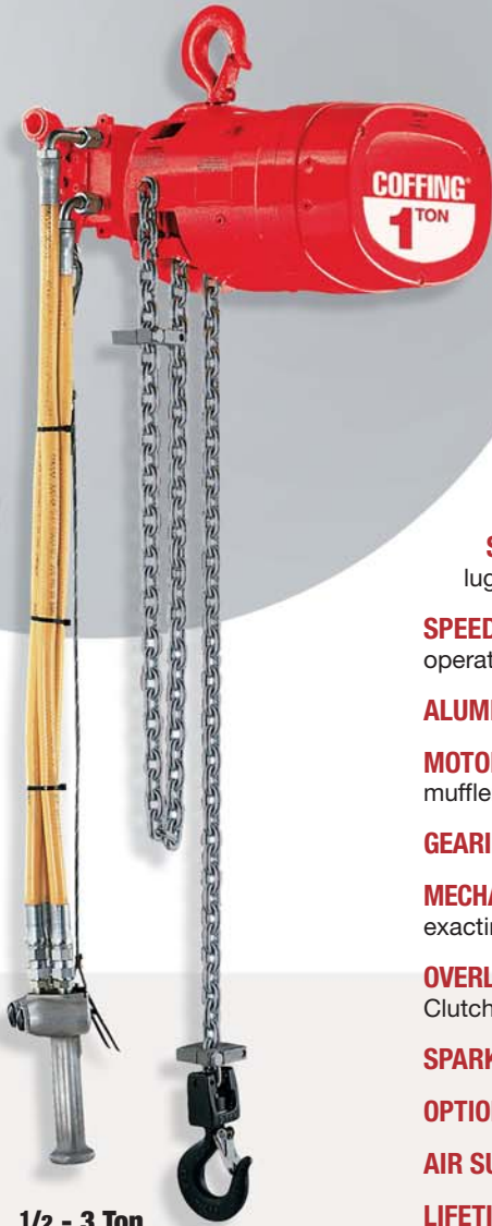
1/2 - 3 Ton